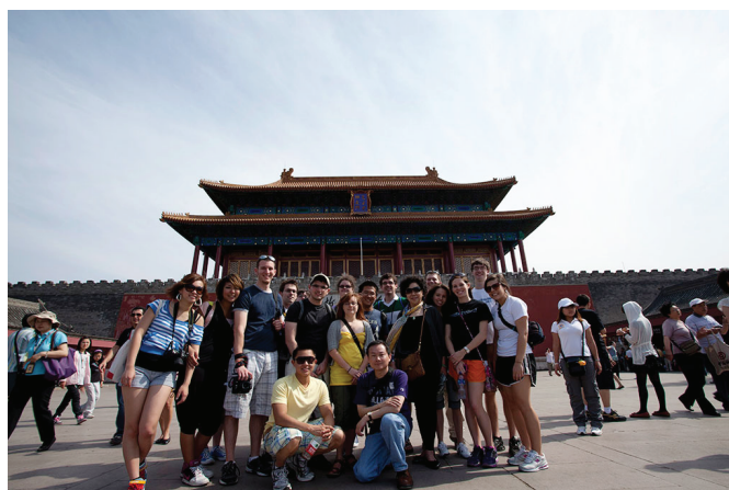
Truman students and faculty at Forbidden City, Beijing