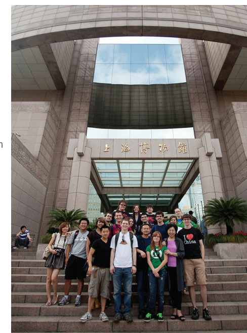
Truman students and faculty visited Shanghai Museum