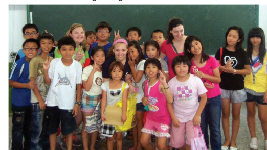
Truman students taught English and American culture in Taiwan

The program has no cost for students who are participating in the faculty-lead China Summer Study Abroad Program. The Education Department of Changhwa, Taiwan will provide air fare from Shanghai to Taipei, room and board, and all traveling expenses for the month of July in Taiwan.