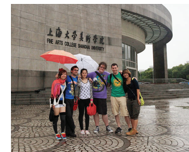
Truman Visual Communication students visited College of Fine Arts of Shanghai University